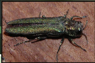
Adult emerald ash borer

The economic impact on communities and landowners across the state will be enormous.