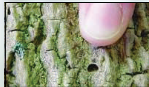
The distinctive D-shaped exit holes made by emerging adult EAB

The best indicator that the tree is infested with emerald ash borer is the presence of small D-shaped holes on the bark of the tree. These holes are created as the adult emerald ash