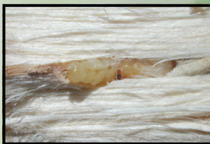
EAB larvae feeding on tree tissue

The adults are slender, green metallic beetles about 1/2 inch long. They began emerging from infested trees and wood in early summer. The adults fly to a nearby ash and deposit eggs on the bark. The larvae hatch in about a week or two, burrow into the inner bark of the tree, and begin to feed.