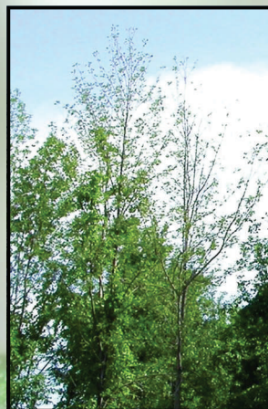
EAB infested tree with dieback at the top

The first indication that a tree is infested is yellowing and thinning of the foliage. Later, often within the same season, the upper branches will begin to dieback. This progressive dieback continues until the tree dies, a process that may take one to several years. Sometimes the tree forms epicormic sprouts - long, thin, fast-growing shoots - along the trunk during the advanced stages of decline.